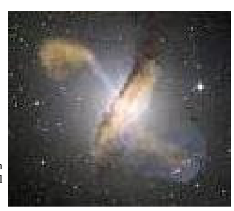
Fig.1 NGC 5128 Centaurus A. The sub. mm. Radio source comes from the receding gas jet. Note the plasma cloud / halo. Electromagnetic waves diffract and move through it at 'c' in the local inertial field.

The last vestiges of the jet hang in space. As the plasmasphere starts rotating the inner jet 'arms' rotate with it. These form the bar of a new open spiral galaxy, which slowly tighten with rotation. The dense ionised particle plasma halo is the dark matter that binds the galaxy together gravitationally, forming it's local 'inertial field' of CMBR rest frame. The discrete field model (DFM) uses co-ordinates 'attached to a body' as Einstein specified (though non rigid) creating a volume, with boundaries, rather than the simple Cartesian unreal abstractions of lines and points adopted for mathematics. This rejoins Locality and Reality with a quantum mechanism, the gravitational plasma's refractive diffraction slowing and bending the em waves by atomic scattering to give curved space-time, equivalent to the Maxwell/Einstein weak field approximation. We must remember our observed reality is always unique and subjective, and would vary in another position and inertial frame. What we observe is therefore always apparent and mathematical re-tracing and analysis will always be required to find the real and non-observable original 'emitted' signal. Measurement is only real within each inertial frame.