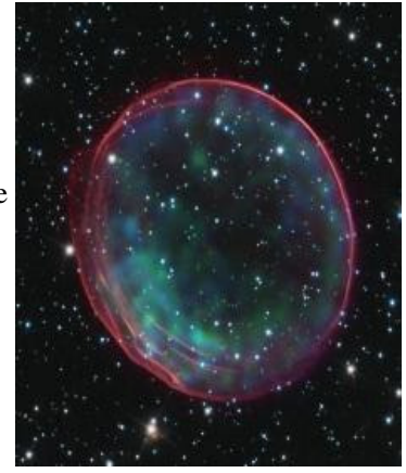
FIG. 2. The expanding Plasma Bubble in the Large Magellanic Cloud; NASA, ESA, Hughes.

particles, the scattered signal from each one travelling at c', but the sequence will give an apparent c^1 = c/n + v_p . This is entirely allowable without breaching either SR postulate as it is moving in a different frame/field and nothing breaches the limit c' in reality. Observing from a different inertial frame allows apparent. c + v.