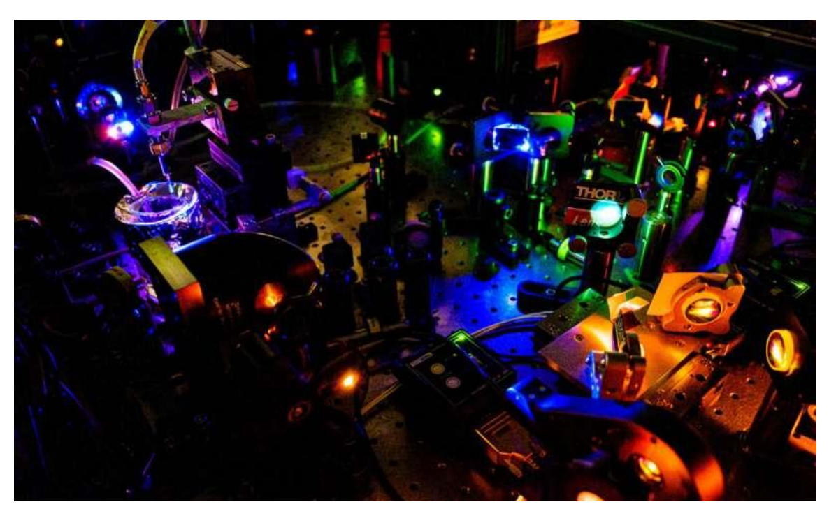
NTU experiments are conducted using tabletop laser equipment for fundamental chemistry, which led to the collaboration with Argonne and DESY.

Understanding the formation of the hydroxyl radical could be of particular interest in aqueous environments containing salts or other minerals that might, in turn, react with ionized water or its byproducts. Such environments could include nuclear waste repositories or other places in need of environmental remediation.