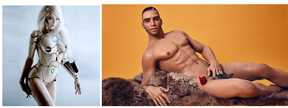
Forms of artificial body

Some people are already creating robot copies of themselves, how they would like to look after the resurrection.