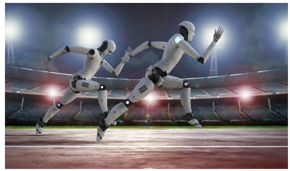
Robots - sportsmen