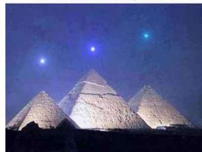
PLANETARY ALIGNMENT WITH THE GIZA PYRAMIDS, IT ONLY HAPPENS ONCE IN 2,737 YEARS

In this introduction I'll refer just to some interests we got by the 2737 Egyptian phenomenon.