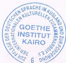
Leiterin der Spracharbeit