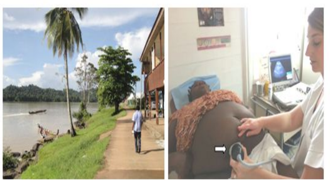
Figure 3: a) Apatou dispensary (Amazonian forest, French Guyana) b) Pregnant, midwife, tele-echograph and motorized probes