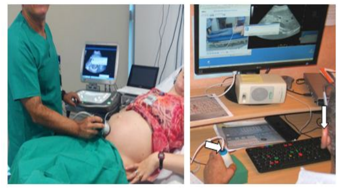
Figure 2: a) The patient site with the non-sonographer operator (midwife) holding the motorized probe on the pregnant and b) the expert site with the expert sonographer manipulating the dummy probe with his left hand (arrow) and selecting the ultrasound function on the keyboard with his right hand (arrow). On his screen the ambient video from the patient site with the pregnant and the midwife, and the echographic video.

a linear array transducer (5-15MHz) used for the assessment of superficial organs. In contrast to the convex probe, the linear transducer was only tele-operated using one motor for the tilt movement (+55° to -55°) as it was believed that the non-sonographer operator would be able to identify the long and shot axes of the superficial organs of interest (blood vessels, muscles). The probes were connected to the echograph using the standard probe connector through which the echograph sent the order sent by the expert to change the orientation of the transducer. Using custom software (Optimalog, St. Cyr-sur-Loire, France), movements of a dummy probelocated at the expert site were mimicked by the transducer of the motorized probe at the patient site (Arbeille et all 2016).