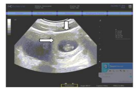
Figure 6: Example of fetal tele-echography of an 8 GA pregnancy, with poor satellite communication. The upper and left border of the uterus is not clearly display, such image could be improved by giving the priority to the quality of the image.

sample volume inside the vessel and trigger the pulsed Doppler mode. Lastly the Expert adjust the Doppler gain, the spectrum baseline, the frequency scale, the sample volume size... On the frozen Doppler spectrum the expert can measure systolic, diastolic velocities, vascular resistance indices.