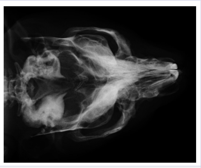
Figure 3: Dorsoventral view of a skull radiograph from a pet guinea pig with facial nerve paralysis. Severe radiodensity of the right tympanic bullae is noticed. The culture of the right tympanic bulla taken at necropsy was positive to Bordetella bronchiseptica .

Nakagawa (1969) describes the respiratory disease produced by Bb in guinea pigs as being low virulent with little or no mortality [7]. Others describe epizootic outbreaks with high virulence and mortality [6,8]. As we will see later, there are several factors that may influence these discrepancies, including the bacterial strain.