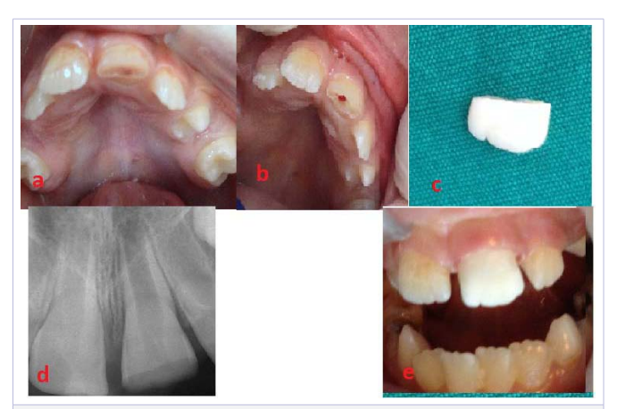
Figure 7a,b,c,: Case 3. Intraoral view before treatment (a).Pulpatomy with MTA (b,c). The vestibule view after the treatment (d).