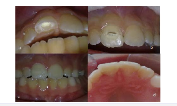
Figure 2a,b,c,d: Case 1 intraoral view. Pulpatomy with MTA (a). Fracture tooth fragment repozisyon (b). The vestibule view after the treatment (c). The palatinal view after the treatment (d).

Case 3: A 10-year old girl presented at our clinic with a fracture in tooth no 21 following dental trauma. In the clinical and radiological examinations a complicated crown fracture was determined in tooth no 21. It was noticed that there was