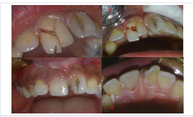
Figure 9a,b,c,: Case 4. Intraoral view before treatment (a).Pulpatomy with MTA (b).The vestibule view after the treatment (c). The palatinal view after the treatment (d).