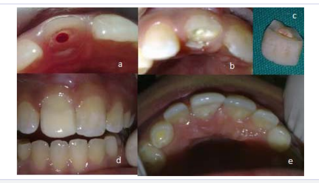
Figure 4a,b,c,d,e: Case 2 intraoral view. Pulpatomy with MTA (a,b). Fracture tooth fragment (c). The vestibule view after the treatment (d). The palatinal view after the treatment (e).