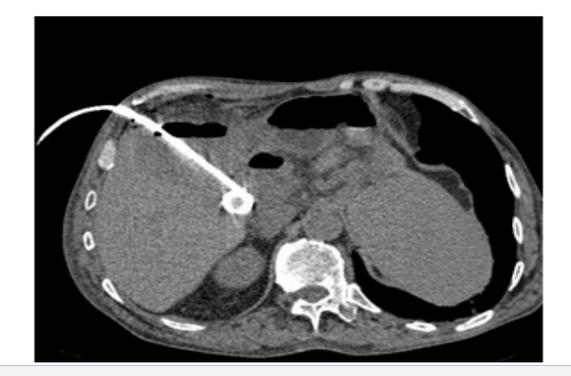
Figure 4: CT scan of drainage of biloma

0.9 to 1.13 ukat/l, ALT increased from 0.63 to 1.21 ucat / l, ALP levels increased from normal level to 2.41 ucat / l, but the leukocytes count decreased from 20.35 postoperatively to 17.14 x 109 / l. Next days the levels of CRP decreased to 26.02 mg/l and 9.04 mg/l, leukocytes count decreased to 13.13 x 109 / l. The temperature was never higher than 37 degrees of Celsius and the clinical finding on abdomen showed no evidence of peritoneal irritation. The interdisciplinary cooperation and follow-up again enabled the successfull conservative management of the second case at last.