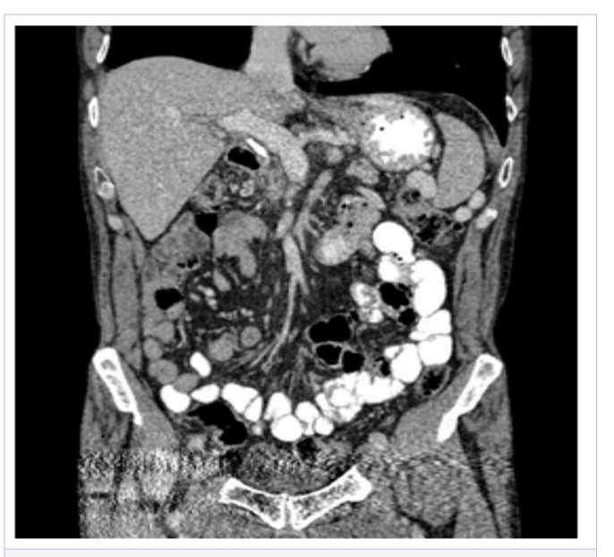
Figure 5: CT scan after removing of drainage and disappearance of collection

As far as the radiological invasive approach, so in all three remaining cases was achieved definite successfull healing after evacuation and drainage of collections under the CT control. The drain was removed after complete decline of production to the drain in the range of 1-3 weeks from the the time of drain insertion. Subsequent clinical and ultrasound controls noticed the full normalisation of the situation. The success of the drainage under the CT control are shown in the following three pictures. The first picture is the CT identification of biloma after open cholecystectomy, the second picture shows drainage of the collection and the third picture shows the image after disappearance of biloma and removal of inserted drain (Figure 3,4,5).