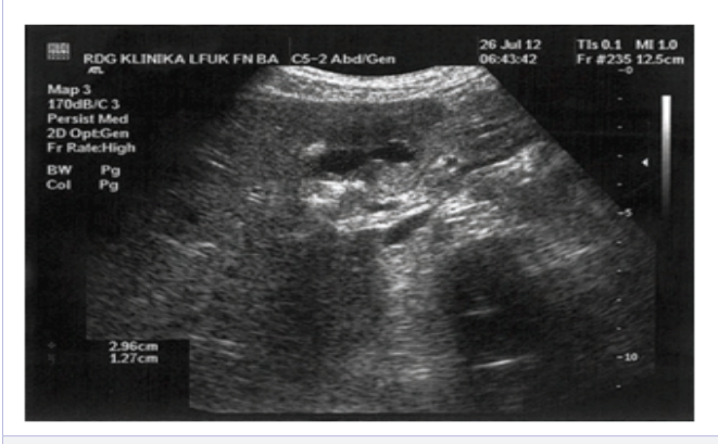
Figure 2: US imaging of biloma 38th postoperative day

The US examination on the 32nd postoperative day (7th day after the last discharge from hospital) found progressive diminishing of the size of biloma and complete disappearance of intrahepatic collection. When checking in another one - week interval - 38th postoperative day - there was found an almost complete regression of biloma at ultrasound finding (Figure 2). Since then, the patient is completely without any complaints more than one year after the operation.