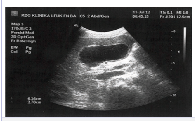
Figure 1: US imaging of biloma 25th postoperative day

count was normalized. Bilirubin and AMS levels were normal through the whole postoperative period. The ultrasound test performed 25th day, showed discrete reduction of the size of fluid collection in the gallbladder bed, the size about 64 \times 27 mm, with persistent communication with the intrahepatic collection of about 12 \times 9 mm (Figure 1). Patient was without fever, with no subjective complaints, and on the base of this positive dynamics, she was released home after 4 - day lasting hospitalization with instructions to come to the outpatient ultrasound control by 7 days.