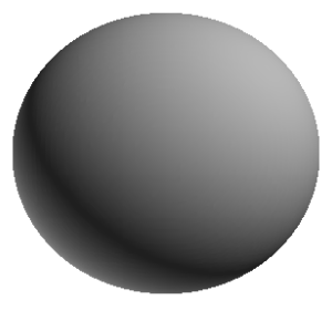
Figure 10: Two black holes of unit mass each, at a distance of 2.