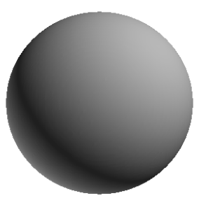
Figure 11: Two black holes of unit mass each, at a distance of 1.