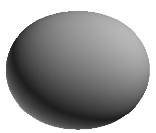
Figure 9: Two black holes of unit mass each, at a distance of 3.