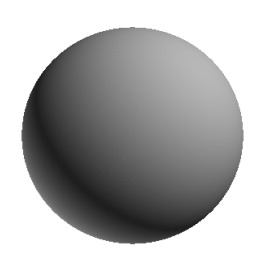
Figure 11: Two black holes of unit mass each, at a distance of 1.